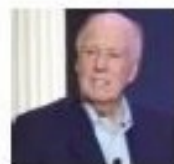
Tom Donilon Chairman, BlackRock Investment Institute

We're in a new world order of geopolitical fragmentation, a full break with the post-Cold War era.”