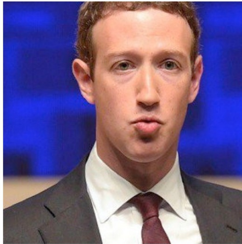
Mark Zuckerberg, Facebook