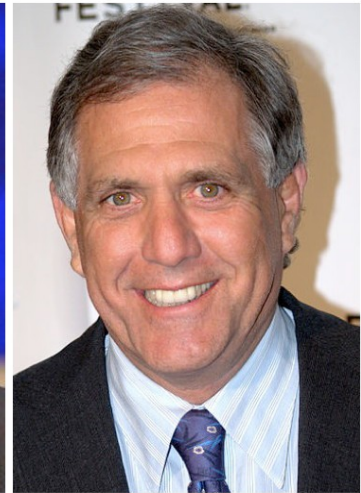
Leslie Moonves, CBS-TV