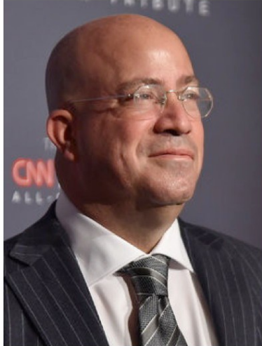
Jeffrey Zucker, CNN