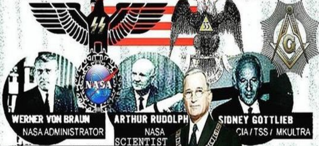
WERNER VON BRAUN NASA ADMINISTRATOR